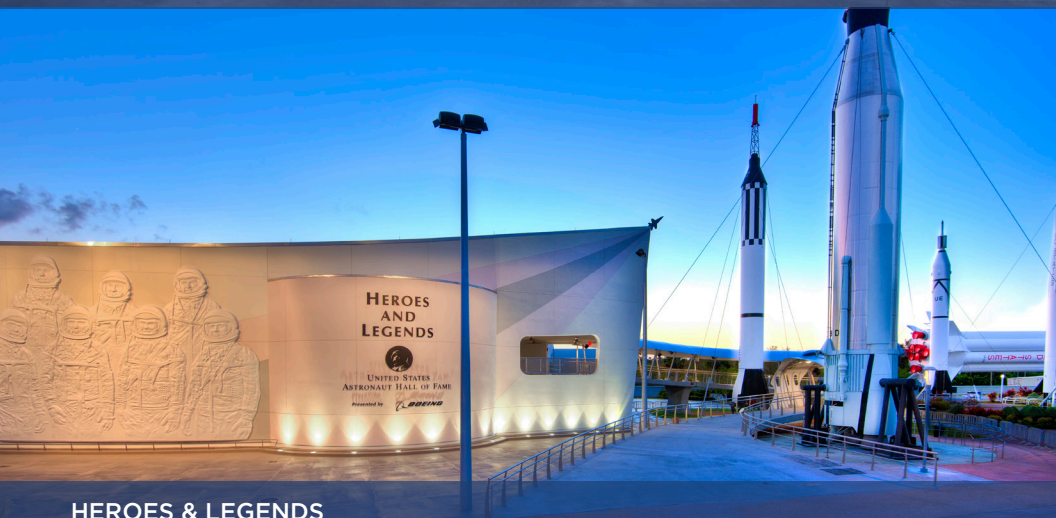
HEROES & LEGENDS