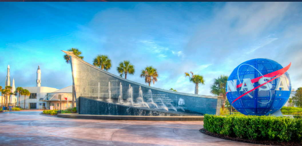
JOHN F. KENNEDY FOUNTAIN