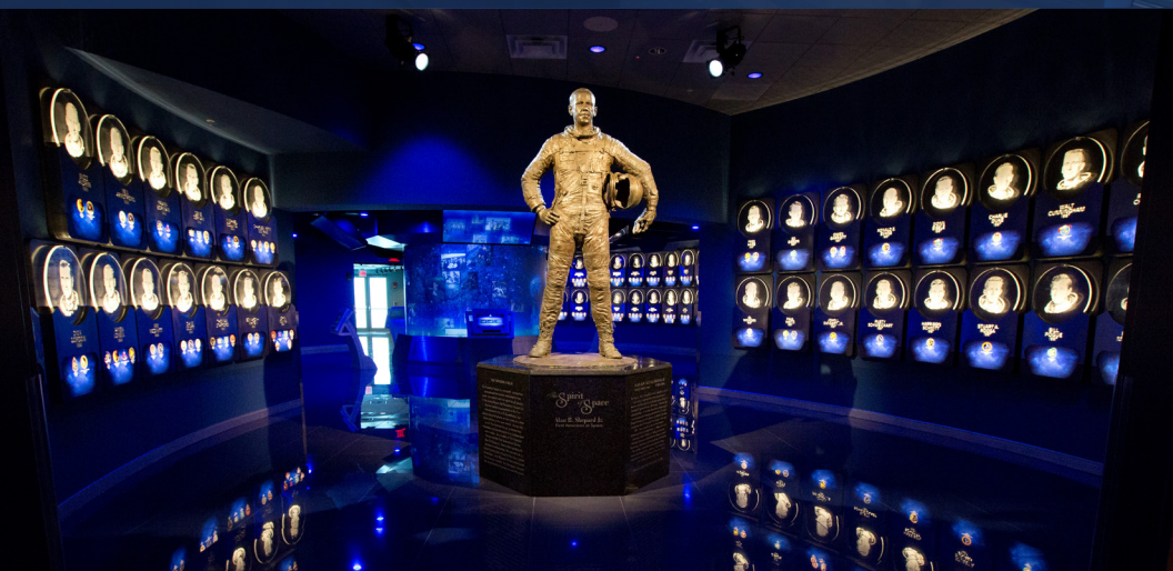
U.S. ASTRONAUT HALL OF FAME